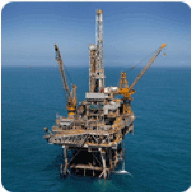
Fortescue Platform