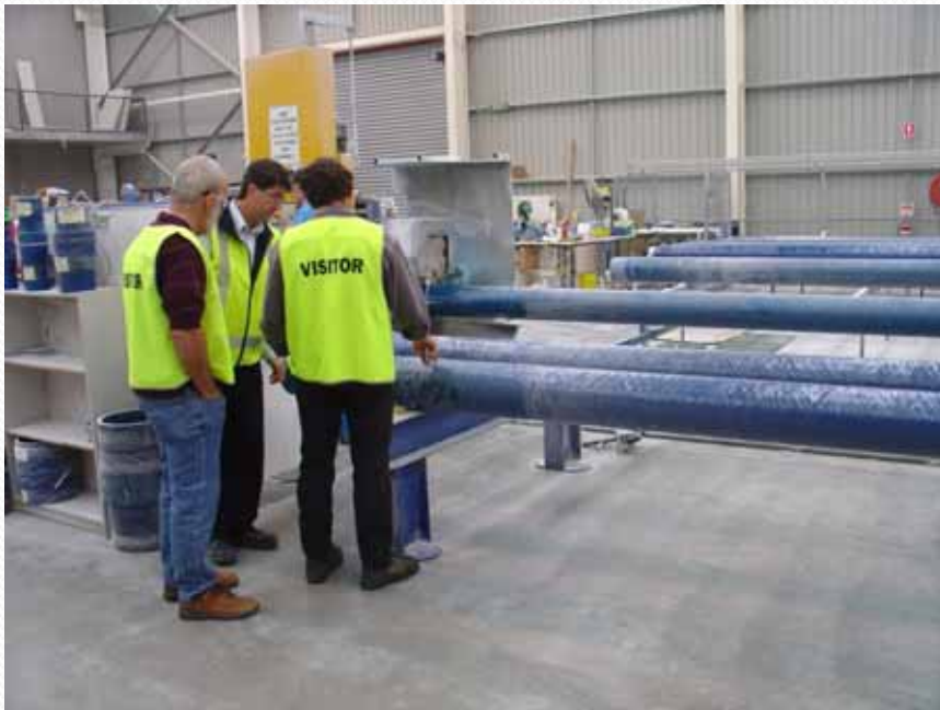
Inspecting production casing